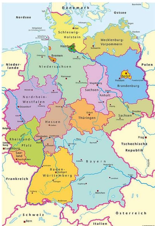
Figure 1: Map of Germany /2/

Germany is a federal country comprised of 16 federal states each responsible for the government of its own state and with the capital Berlin. The reunification of West and East Germany took place on October 3, 1990, /1/. Germany is located in Central Europe and covers about 357 031 km 2 , making Europe's sixth largest nation measured by area. The longest distance from north to south as the crow flies is 876 km, and from west to east, 640 km, /2/. In the northwest Germany is bordered by the North Sea and to the northeast by the Baltic Sea and Denmark. Poland and the Czech Republic surround the eastern border, with Austria and Switzerland to the south and France, Luxemburg, Belgium and the Netherlands to the west. The total land boundary is about 3 757 km, /3/.